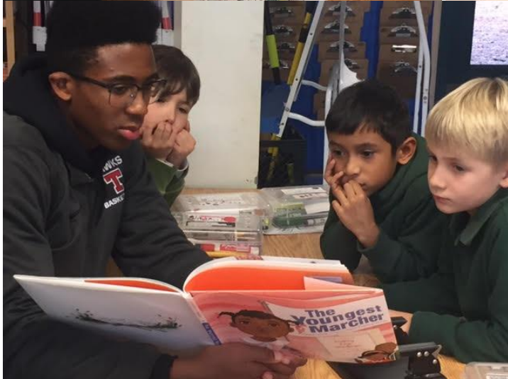
Tam High Reading Buddies!