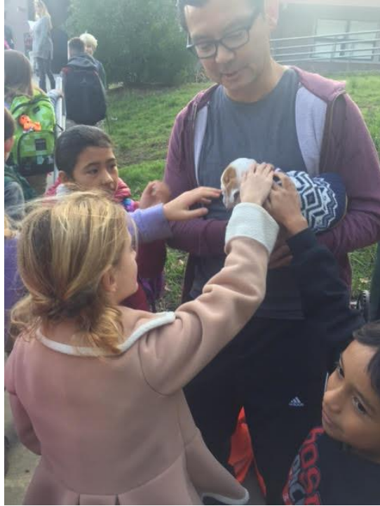
The cutest puppy ever!